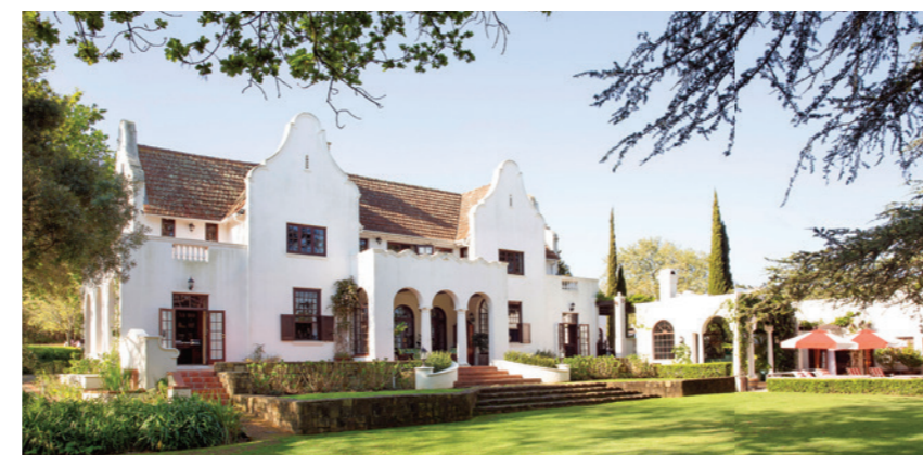
ABOVE: Le Grand Jardin offers an exclusive villa breakaway in the heart of the Stellenbosch winelands