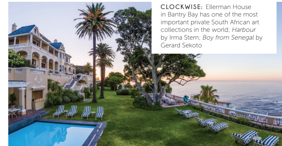
CLOCKWISE: Ellerman House in Bantry Bay has one of the most important private South African art collections in the world; Harbour by Irma Stern; Boy from Senegal by Gerard Sekoto

With more than 1 000 artworks, the Ellerman House collection represents over 200 years of South African history. Discover more at ellermanhouse.co.za .